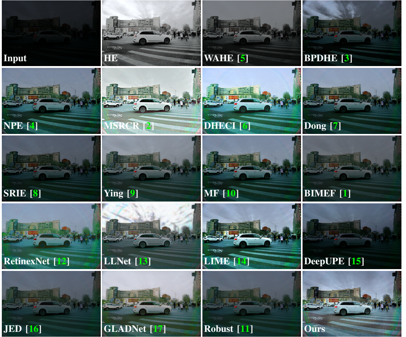
Fig. 1: Comparison results of natural low-light image enhancement.

In order to see the visual difference more clearly, it is recommended to first check the same dark regions in the input images and zoom in on the images if necessary.