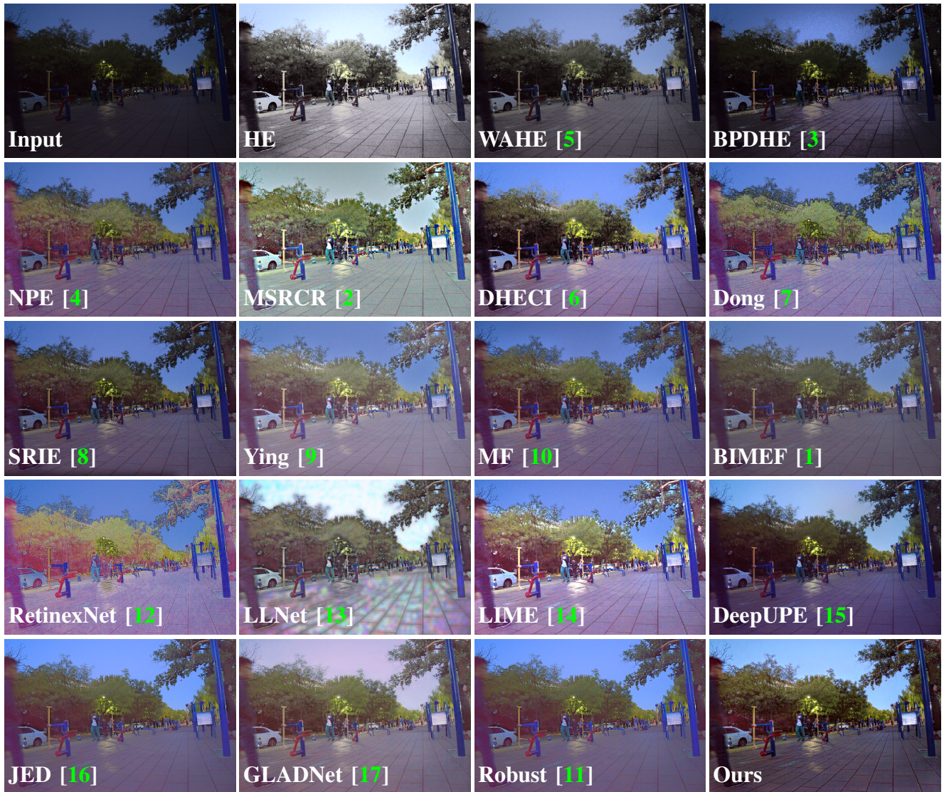
Fig. 2: Comparison results of natural low-light image enhancement.